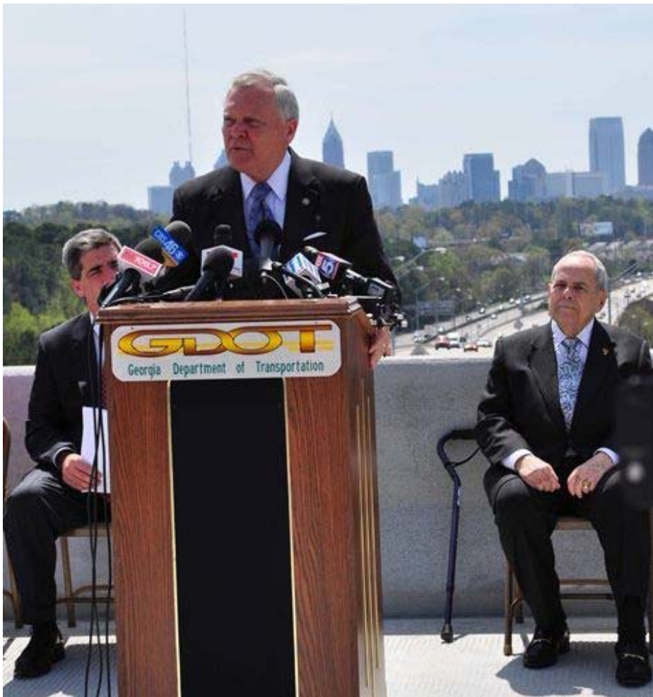
Governor Deal speaks at ribbon cutting for the new GA 400 flyover ramps to I-85, while DOT