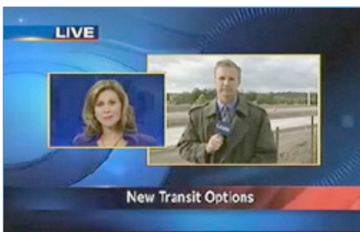
KSTP - Click image for video

When a 12-mile stretch of HOT lanes opened in the Twin Cities, a local TV station provided extensive prime time coverage of the event including interviews with transportation experts and elected officials. Teamwork between agencies was cited as a factor in the project's successful implementation.