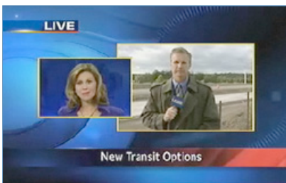
KSTP - Click image for video

When a 12-mile stretch of HOT lanes opened in the Twin Cities, a local TV station provided extensive prime time coverage of the event including interviews with transportation experts and elected officials. Teamwork between agencies was cited as a factor in the project's successful implementation.